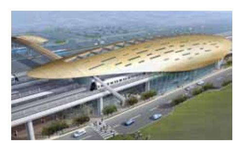
Dubai Metro, Dubai