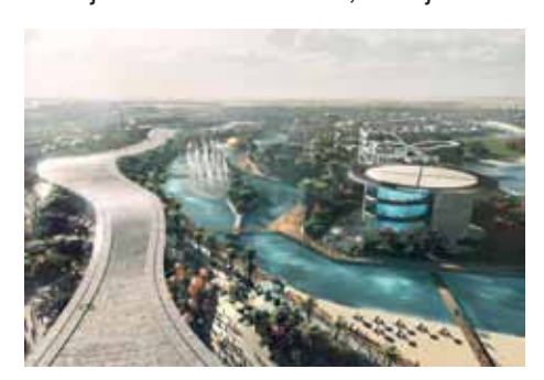
MBR City, Dubai