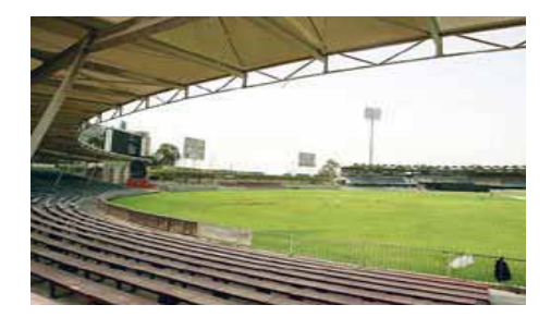
Sharjah Cricket Stadium, Sharjah